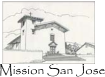
Mission San Jose